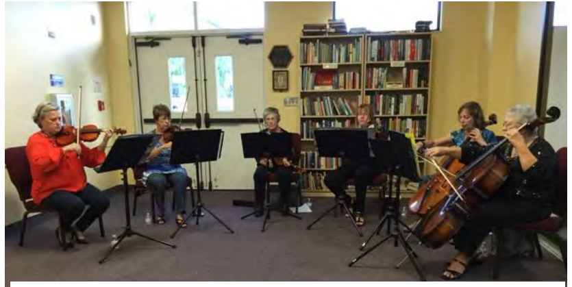
“The Noteables” serenaded us during the cocktail hour.