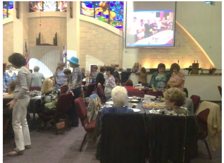
Just enjoying each other's company ~ that's what sisters do...