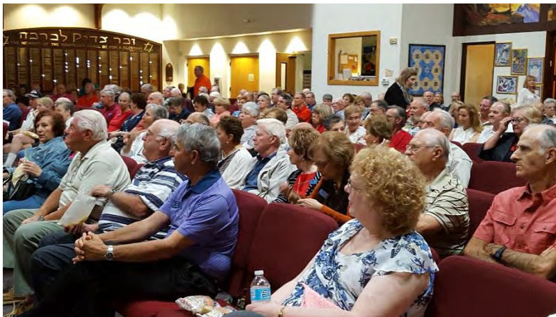
Audience at "Above and Beyond" film at Temple Shalom - Dec. 7, 2016